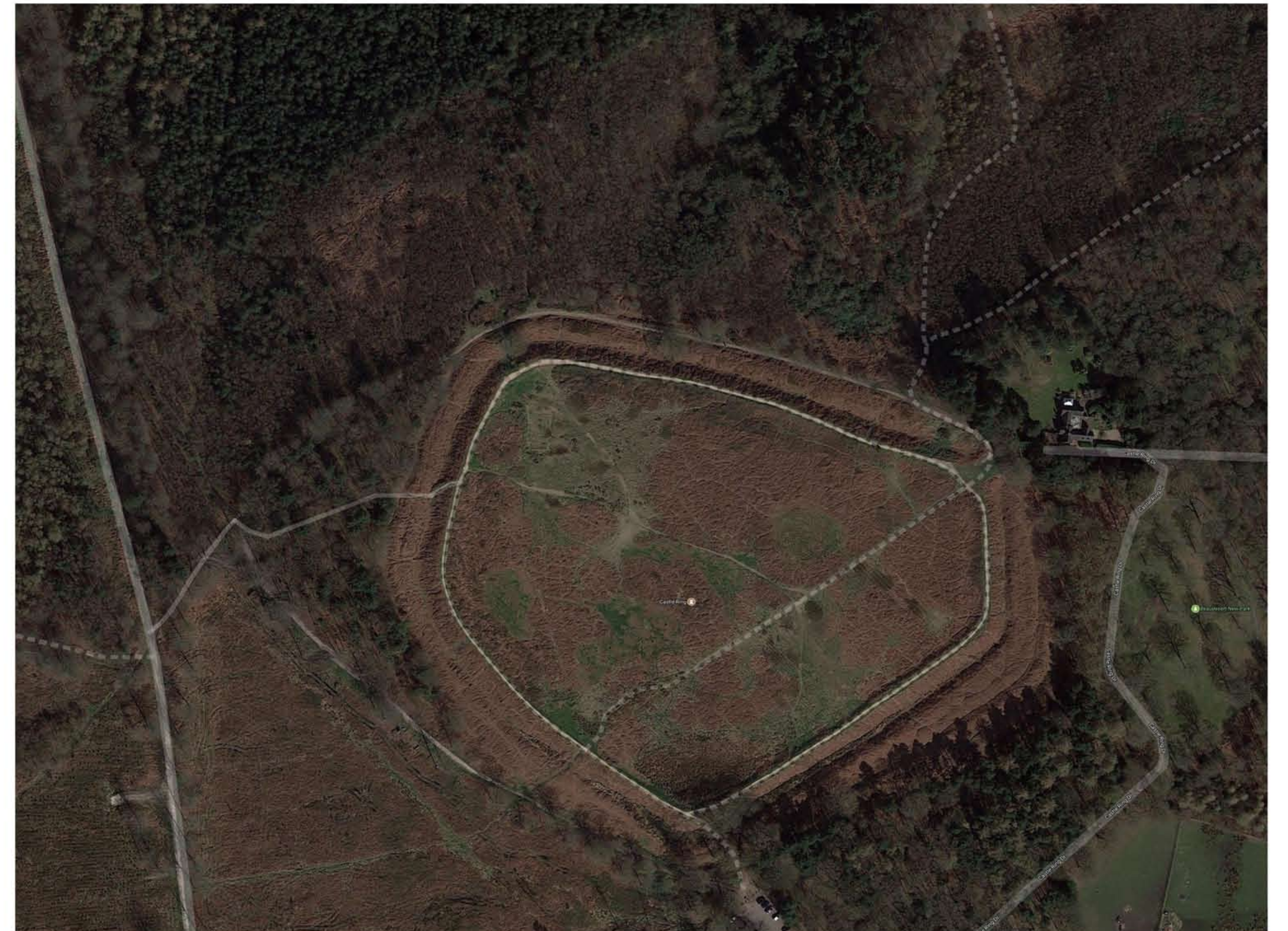
Drone, 7.9.16. 1200 ft, 366 m