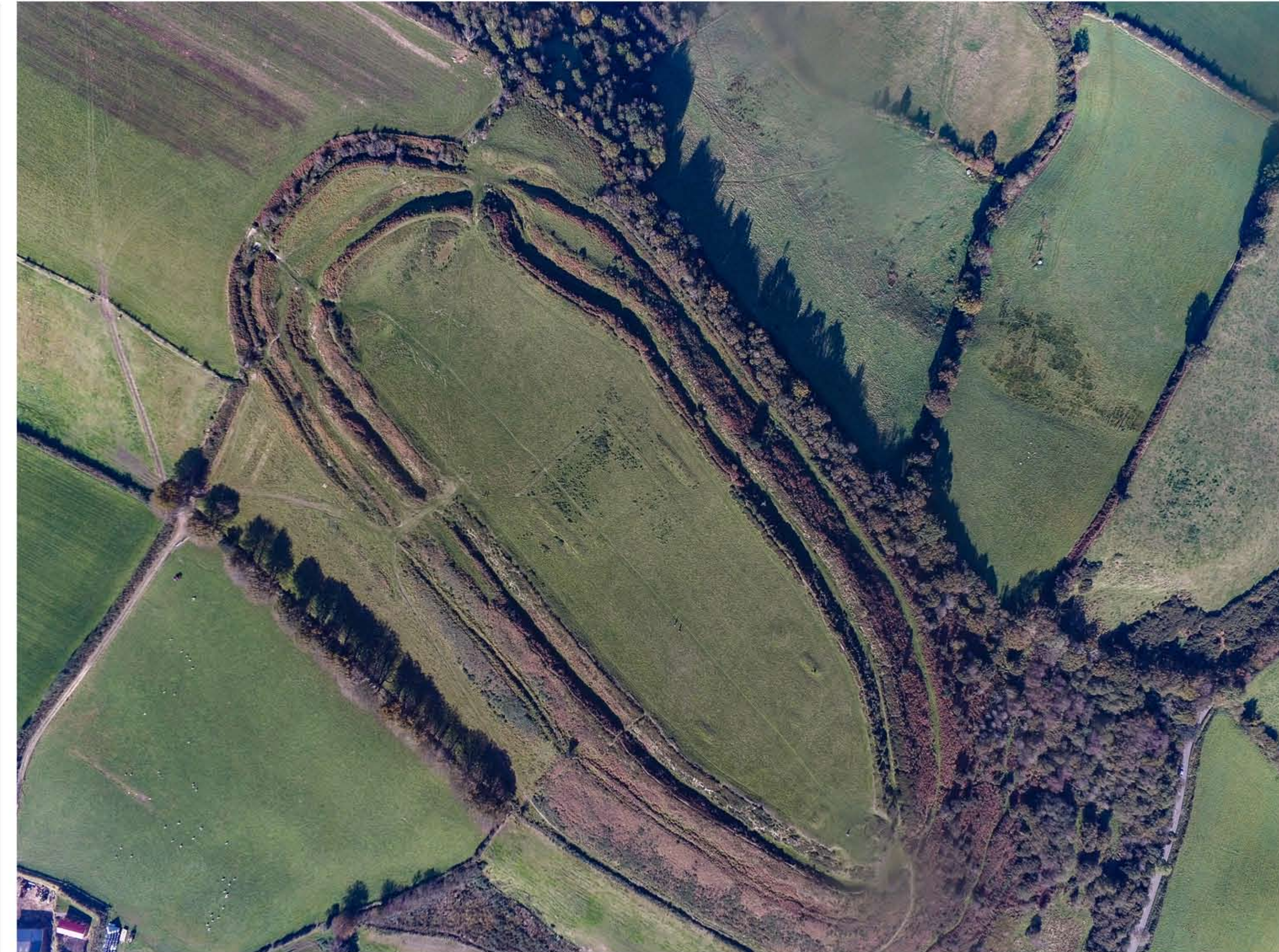
Drone, 21.10.16. 1200 ft, 366 m