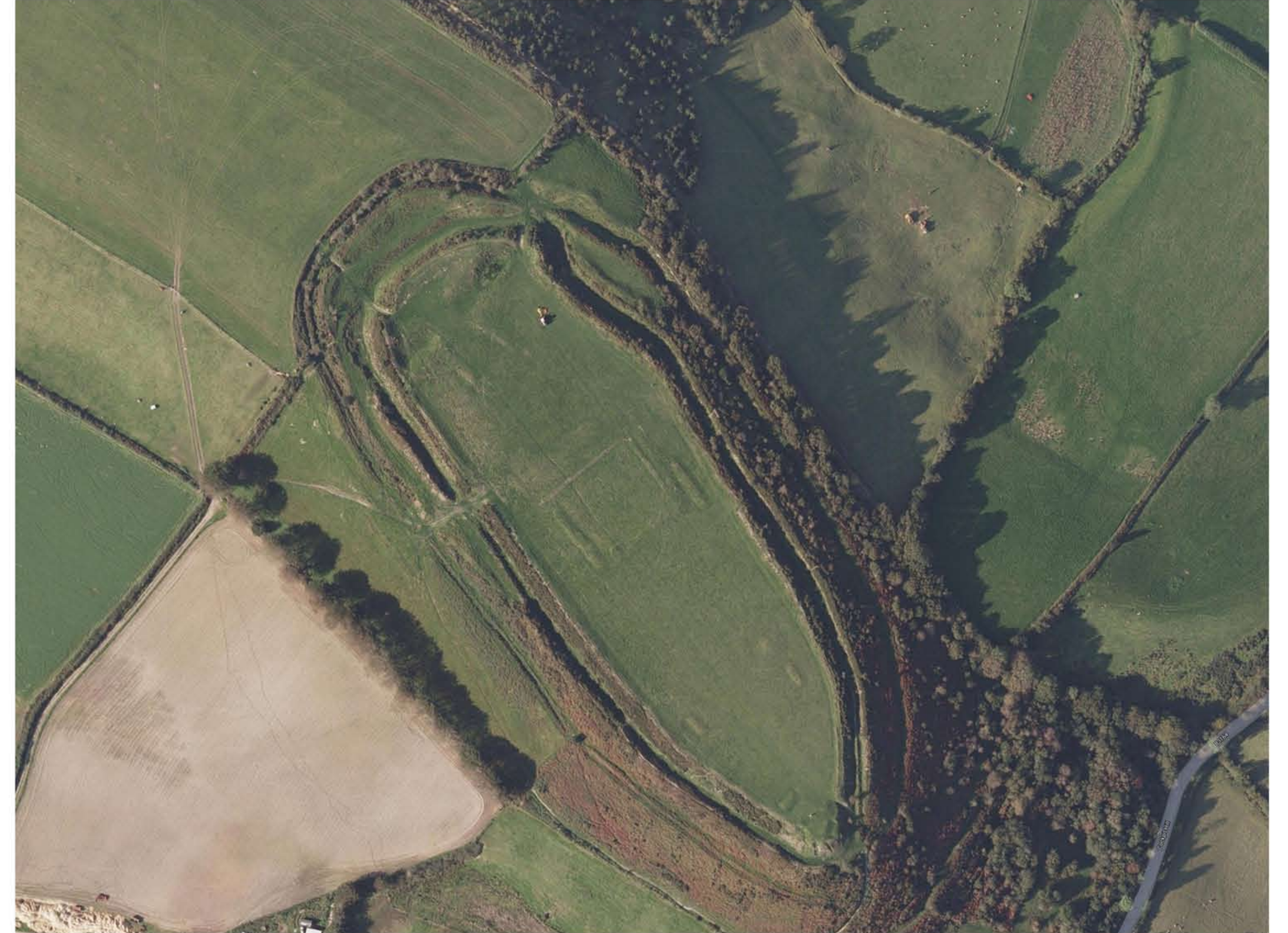
Google Maps, 2001